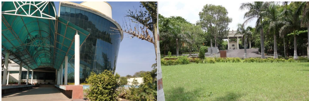
A View of the NLIU Campus